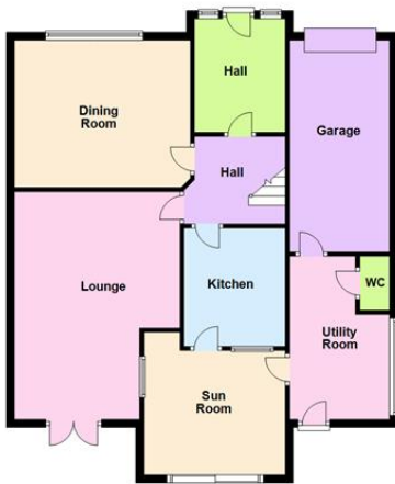
13 Arundel Gardens, Westcliff on Sea